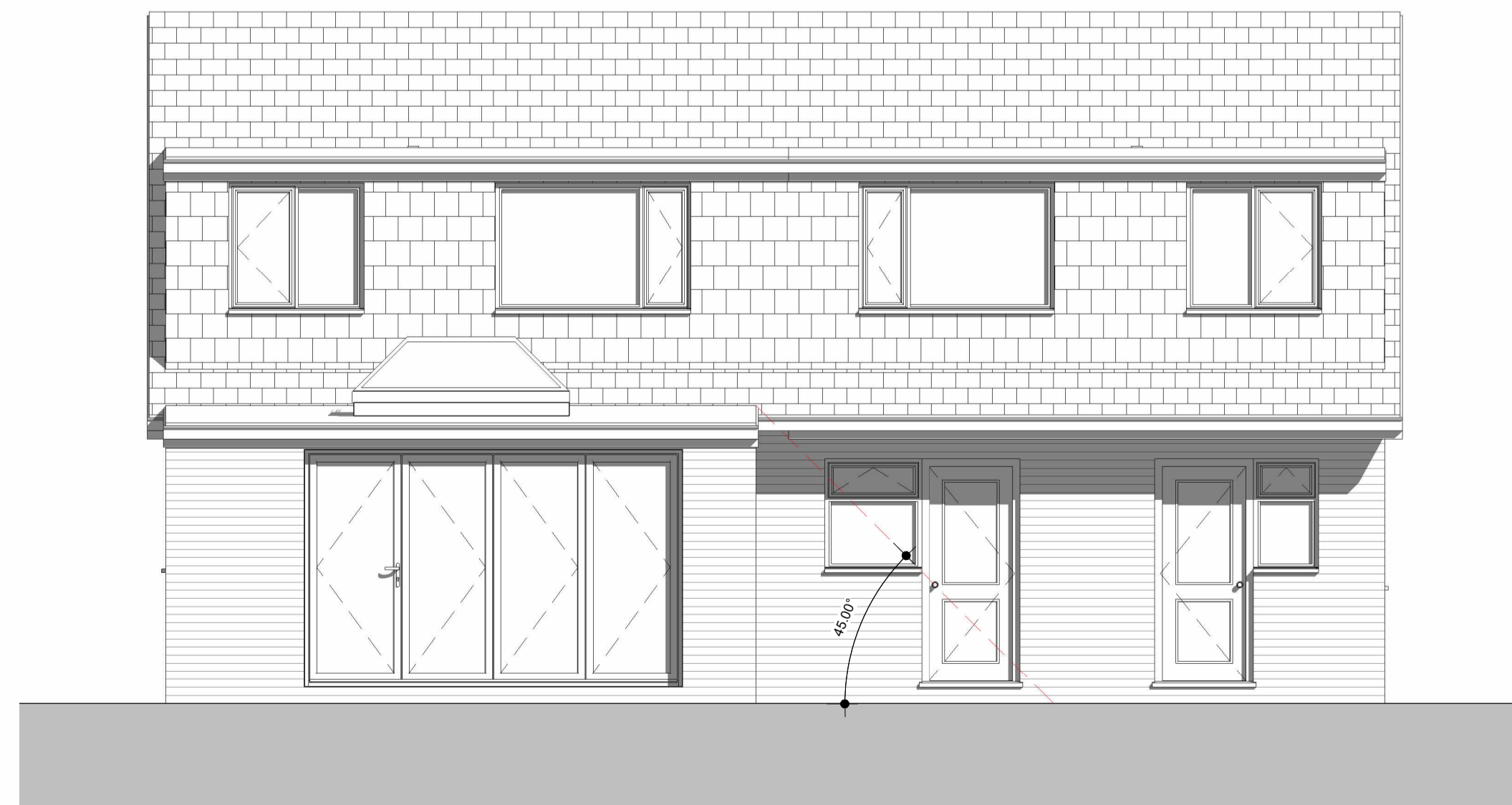
Proposed Rear Elevation - 45 Degree Check 1 : 50

Note Details and dimensions of proposed plans to be checked on site by appointed contractor prior to any commencement/ordering of materials or work.